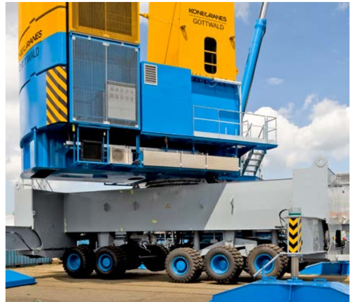
The Model 3 crane features a hybrid drive made up of a diesel-generator set and short-term energy media to reduce fuel consumption and exhaust emission and help create a quieter operating environment